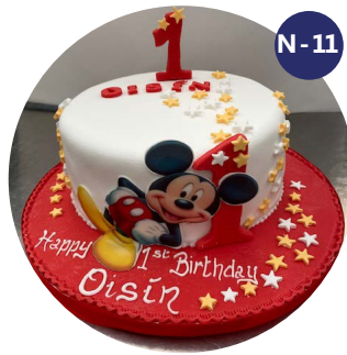
MICKEY MOUSE CAKE