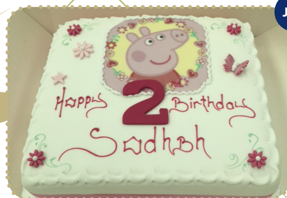
10" X 8" NOVELTY CAKE IN SUGAR PASTE