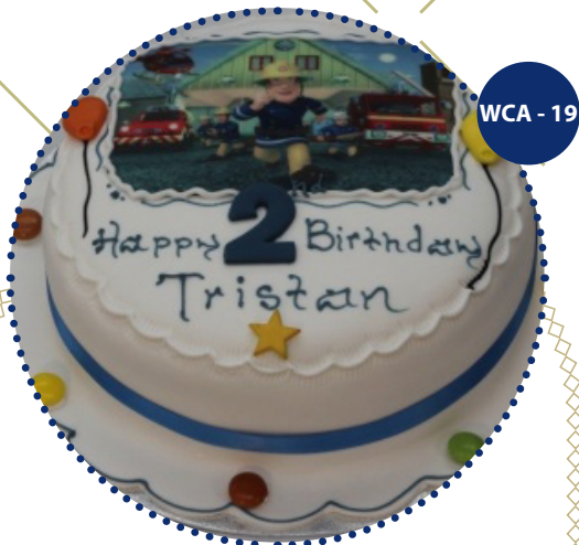
8" FIREMAN SAM NOVELTY CAKE IN SUGAR PASTE