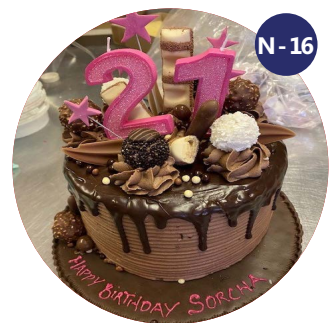
21ST B-DAY CAKE

NOTE: CUSTOM CAKES CAN BE ORDERED BY RINGING 065 68 22860 EXT 114 OR BY EMAILING ORDERS@OCONNORSBAKERY.COM . AVAILABILITY IS LIMITED SO PLEASE ORDER WELL IN ADVANCE.