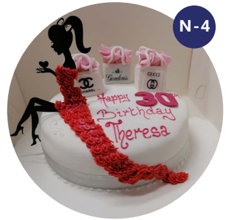
LADY DESIGNER + BAGS