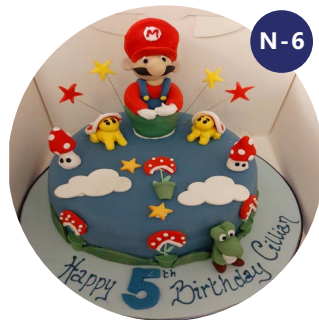
SUPER MARIO CAKE