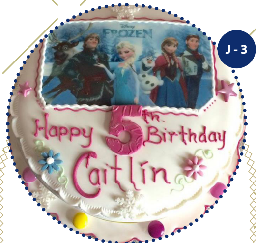
8" FROZEN NOVELTY CAKE IN SUGAR PASTE

Lemon Madeira - €35 Vanilla Buttercream and Jam - €40