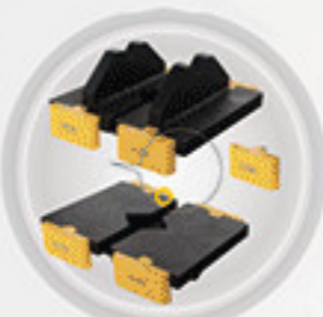
V-Block & 180° Guiding Design