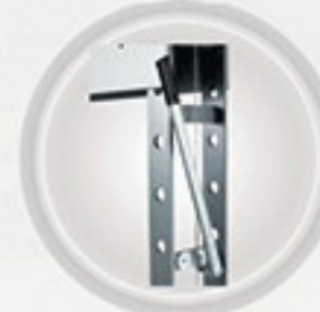
Handle Assy Holder