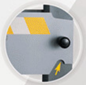
Special Design for More Height Position of Working Bench