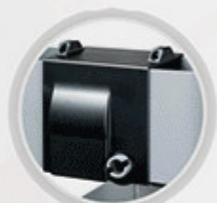
Winch Protection Cover