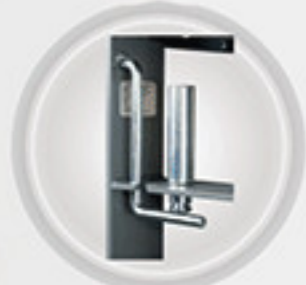
Winch Handle Holder