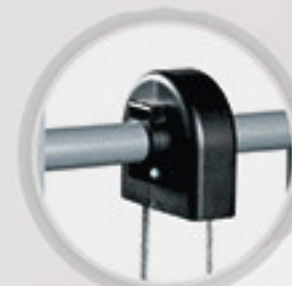
Pulley Protection Cover