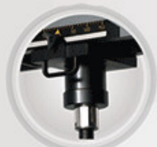
Scale & Sliding Cylinder with Handle