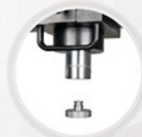
Quick Detachable Top Cover