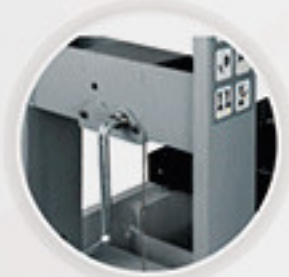
Winch Protection Cover