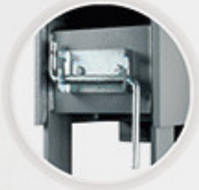
Winch Handle Holder