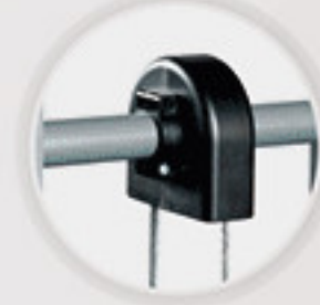
Pulley Protection Cover