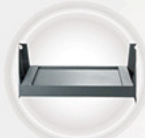
Spare Parts Tray