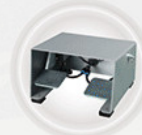
Pneumatic Foot Pedal Switch