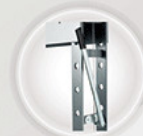
Handle Assy Holder