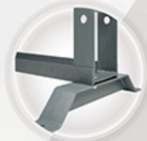
Well-Designed Legs with Bolt Holes