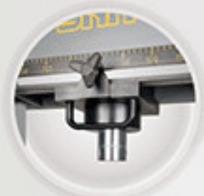
Scale & Sliding Cylinder with Handle and Rotatable Knob