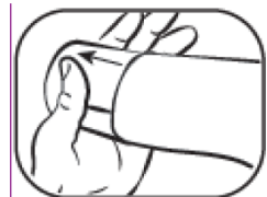
1. Pull off the transparent protective cover