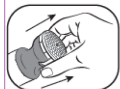
5. Pull white part to open