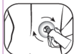
7. Apply to skin, closing cap on application