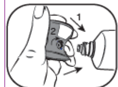
3. Using the key on the applicator cap to remove the star seal on the tube