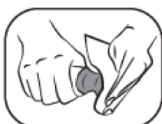
8. Clean the applicator with cotton towel or absorbent paper until visually dry and clean

This medicine must not be used in children under 14 years of age