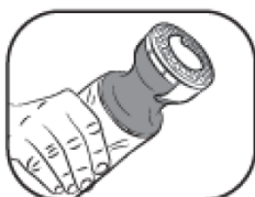
6. Squeeze the tube to release required amount of Emulgel