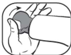
2. Unscrew the applicator cap