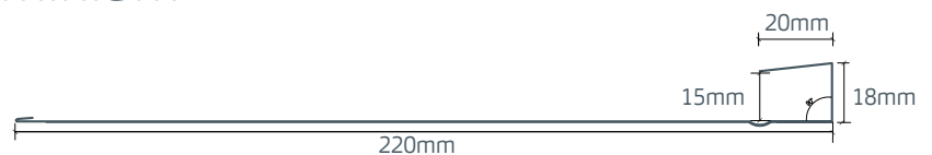
Fibre Cement Slate