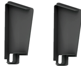
C08PFEBL Standard End Cap