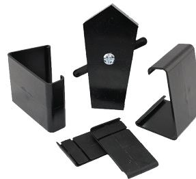
C08PFBL Complete Pack