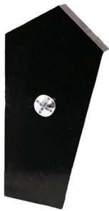
C08PFABL Apex Jointer