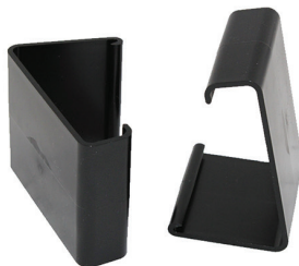
C08PJEBL External Jointer