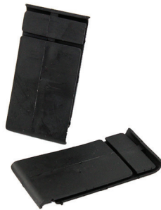
C08PFJIBL Standard Internal Jointer